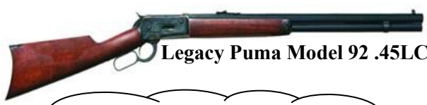
Legacy Puma Model 92 .45LC

2 Dinner Tickets $70.00 Bucket Drawing Tickets $300 Value 30 chances on 4 Guns 30 Bonus + 120 Bucket Raffle Tickets One entry in the Prestigious CHARLTON HESTON/ drawing for a: